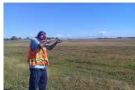
Figure 16 Wildlife culling

B.1.15 Trapping/Killing/Culling; Constructive measures should be taken to limit the presence of mammals. If removal is desired or required, experienced hunters or trappers should be called upon to assist in the trapping or removal of wildlife. If they persist despite these measures, it is likely that more permanent measures should be taken such as habitat modification or exclusion methods. The destruction of animals through the killing of individuals and removal of nests or eggs should be carried out in accordance with local legislation. In no case should the destruction of animals be used as the primary and /or sole method of wildlife management on an aerodrome. The use of limited, targeted, lethal control by trained staff may be necessary either to reinforce non-lethal control measures or