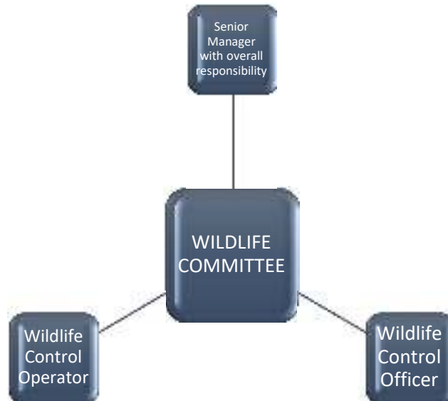
Figure 8 - Wildlife Management Plan Support/Responsibility Structure

6.4.3 Wildlife Committee; The wildlife committee plays a central role in monitoring of the wildlife control and habitat programme. Full training should be provided to ensure all members understand the objectives of the programme. Training should include regular briefings from subject matter experts so that they are fully informed of the potential danger that wildlife habitat pose to aviation at the aerodrome.