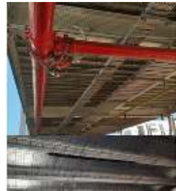
Figure 32 Netting at Nadi Airport