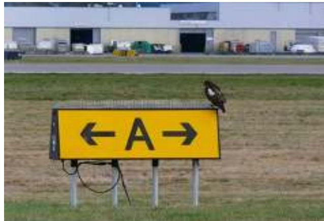
Figure 5 Deterrent Spikes don't keep all birds off off signs.