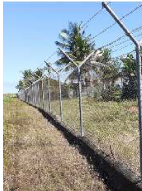
Figure 3 A well-maintained chain-link fence with no gap at the bottom is effective in keeping out hazardous mammals, such as dogs, from critical areas and is ideal for airport use.

5.2.3 The key to habitat management is avoiding conditions that attract wildlife such as food, water, shelter, and resting and breeding areas.