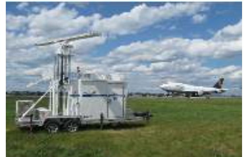
Figure 4 - A bird detection radar

5.7.2 Coordination between the remote monitoring center and operators that might respond to wildlife sightings is required.