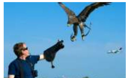
Figure 54 Using trained falcons to direct birds away from planes during the critical moments of takeoff and landing.

B.1.13 Trained Falcons and Dogs; Trained falcons and dogs, which are both potential predators for many species of hazardous birds found at airports, are undoubtedly effective in dispersing birds. To work properly, however, considerable investment in the training of both the animals and their handlers needs to be made. This training is essential to both in order to ensure that the animals do not become a strike risk and also to ensure that the deterrent value of deploying the falcon or dog is maximized. Airports should and cost involved in incorporating falcons or dogs in their