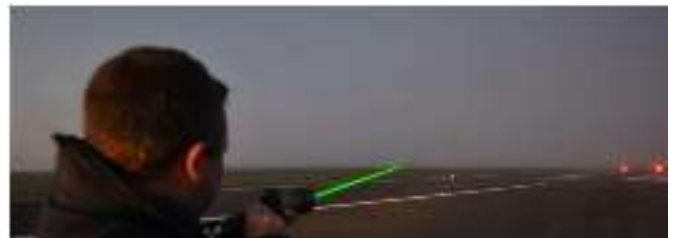
Figure 65 Airport staff using a laser to divert birds from plane pathways.

B.1.14 Lasers; Lasers can be used to scare birds away. Trials have been conducted with fixed devices that use laser beams to scare off birds. Fixed lasers units and hand held lasers can be useful in dusk/dawn or night time, however it is recommended that trials are undertaken before purchasing expensive equipment. Some bird's species react only to some colors of laser, so local testing needs to verify what works. Procedures need to be put in place to ensure lasers are used safely and do not create any hazard to users of the airfield or people off-airport.