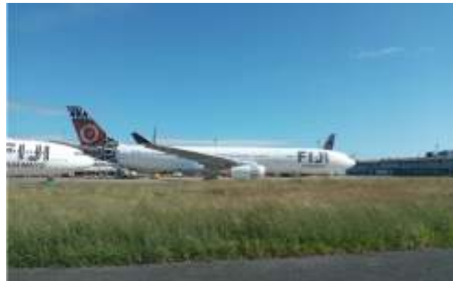
Figure 43 Grass maintenance

It is advisable that aerodrome operators consult with professional biologists and horticulturists to develop a vegetation type and mowing regime appropriate for the growing conditions and wildlife at the location. The main principles to follow are to use a vegetation cover and mowing regime that do not result in a build-up of rodent numbers or the production of seeds, forage or invertebrates desired by wildlife.