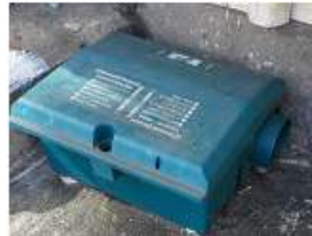
Figure 77 Rodent traps

Using RC aircraft in a busy airport environment requires highly trained operators and a thorough risk assessment, with written procedures, in coordination with other stakeholders such as ATC. Before using RC aircraft, it is important that operators ensure that the radio frequencies used are compatible with other radio uses in the airfield environment, particularly flight crew, airfield operations and air traffic control.