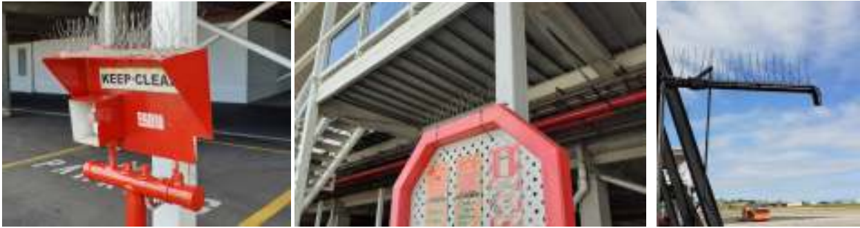
Figure 11 Installation of metal spikes to avoid birds perching

Other measures can be taken to deter birds and other wildlife from seeking shelter and breeding sites on airport property: