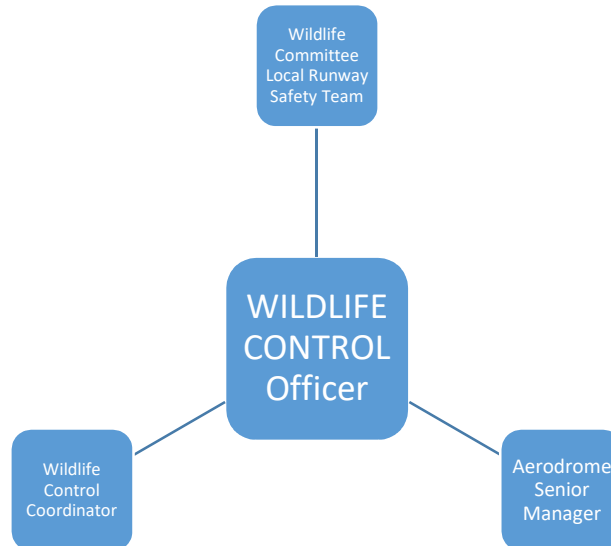
Figure 9 -Wildlife Management Plan Support/Responsibility Structure