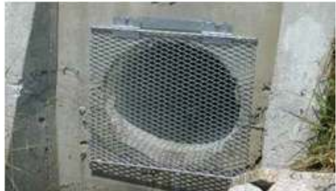
Figure 10 Sealing off culverts/drains

Birds and other wildlife often seek shelter and breeding sites on airport property in such places as the structural beams of hangars and bridges, in nooks of jet ways and other structures, and in trees and shrubs. Some birds, such as gulls and waterfowl, seek the open spaces on airport property for safety while resting. These areas give the birds a clear view of their surroundings in all directions. Dogs and other mammals will seek shelter in dense stands of trees, shrubs and drains.