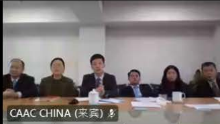
CAAC CHINA (来宾)