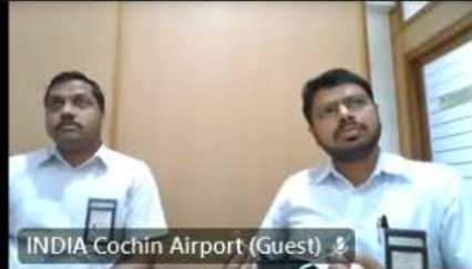
INDIA Cochin Airport (Guest)