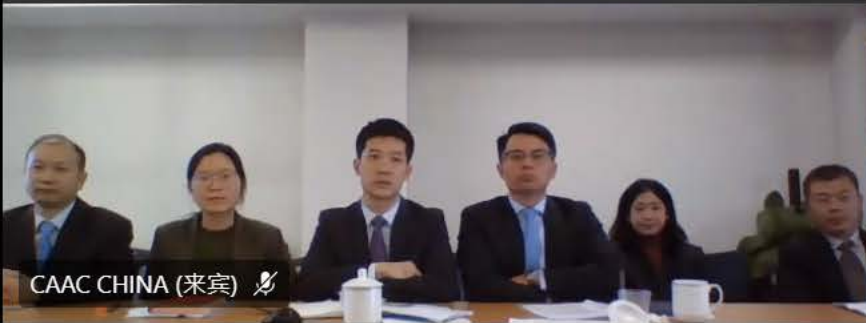
CAAC CHINA (来宾)