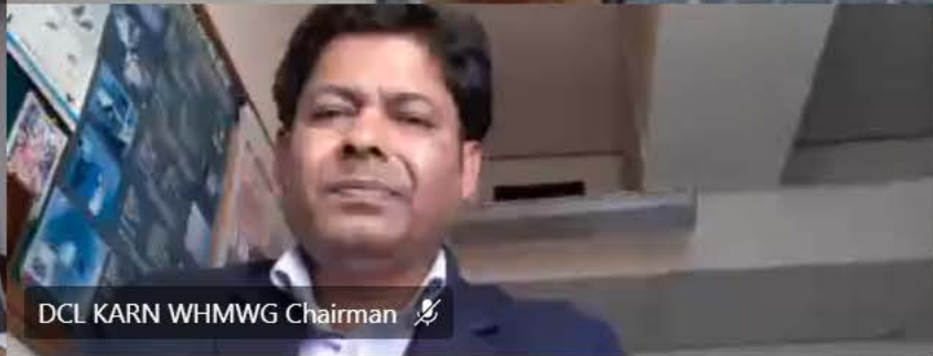
DCL KARN WHMWG Chairman