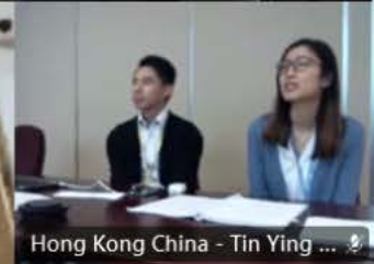
Hong Kong China - Tin Ying