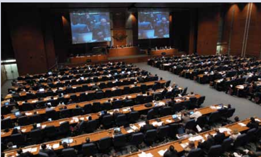
The 2010 ICAO General Assembly was attended by 1,588 participants from 176 Member States and 40 international organizations involved in civil aviation. This is the most participants since ICAO began holding its triennial Assembly event in 1947.