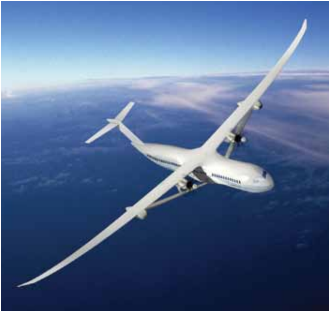
The Subsonic Ultra Green Aircraft Research, or SUGAR, Volt future aircraft design comes from the research team led by The Boeing Company. The Volt is a twin-engine concept with a hybrid propulsion system that combines gas turbine and battery technology, a tube-shaped body and a truss-braced wing mounted to the top of the aircraft. The plane is designed to fly at Mach 0.79 carrying 154 passengers 3,500 nautical miles.