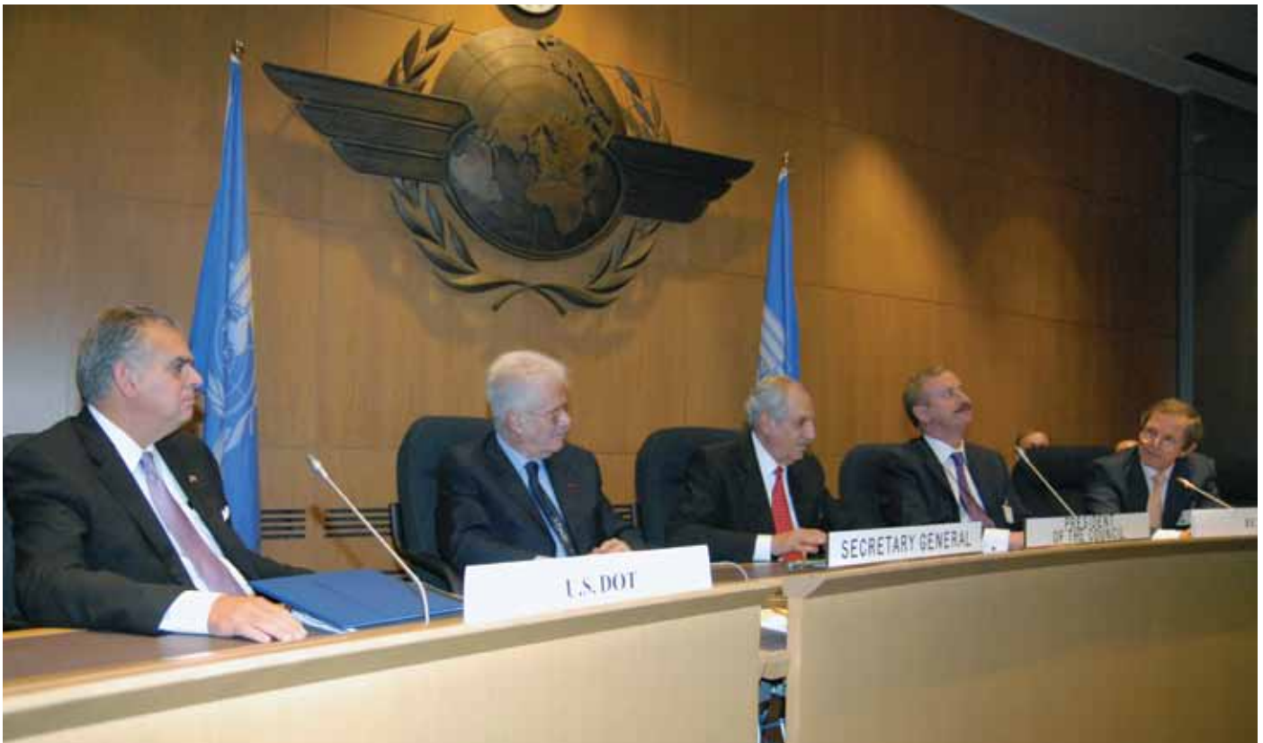
ICAO Secretary General Raymond Benjamin (second from left) and Council President Roberto Kobeh González (third from left) preside over the signing ceremony for the MOU prescribing the creation of a new Global Safety Information Exchange. Present for the signing were U.S. Transportation Secretary Ray LaHood (far left), European Commission VP and Commissioner for Transport, Siim Kallas (second from right), and IATA DG Giovanni Bisignani (far right).

The Assembly also re-affirmed the Safety Framework recently adopted by ICAO. This will allow the Organization to continuously strive to achieve the safest civil air transport system possible, through the following activities: