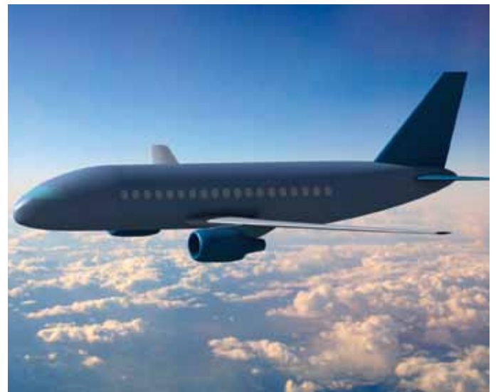
The Silent Efficient Low Emissions Commercial Transport, or SELECT, future aircraft design comes from the research team led by Northrop Grumman Systems Corporation. Deceptively conventional-looking, the concept features advanced lightweight ceramic composite materials and nanotechnology and shape memory alloys. In addition to being energy efficient and environmentally friendly, the SELECT improves the capacity of the future air transportation system because it can be used at smaller airports and make them more effective. It is designed to fly at Mach 0.75 carrying 120 passengers 1,600 nautical miles.