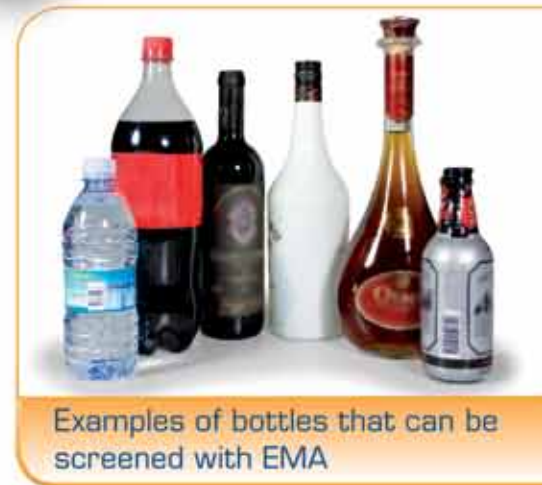
Examples of bottles that can be screened with EMA