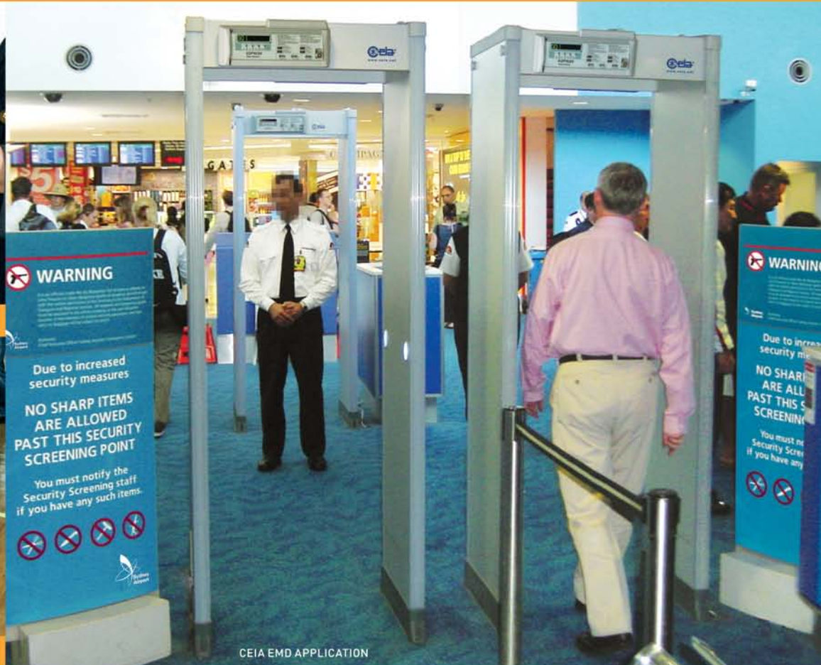
CEIA EMD APPLICATION