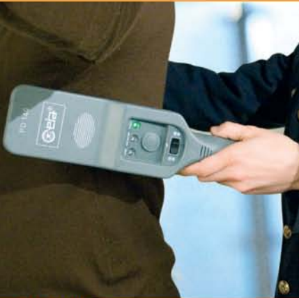
CEIA PD140SVR, ENHANCED HAND HELD METAL DETECTOR