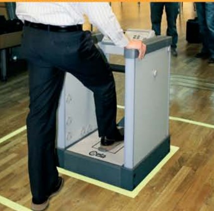
CEIA SAMD, SHOE ANALYZER