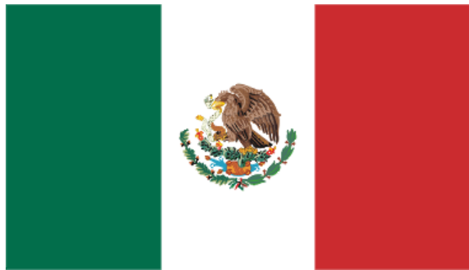
National emblem of Mexico