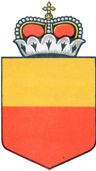
National emblem of Liechtenstein

4. National emblems used in association with nationality marks