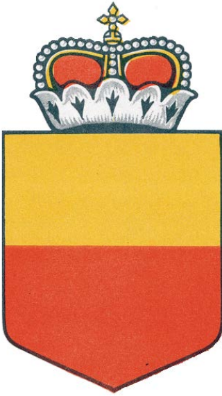
National emblem of Lichtenstein

4. National emblems used in association with nationality marks