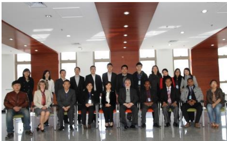
Beijing, China. Participants of the Training Developers Course held at Capital Airports Holding Management Co., Ltd from 8 to 19 April 2013.