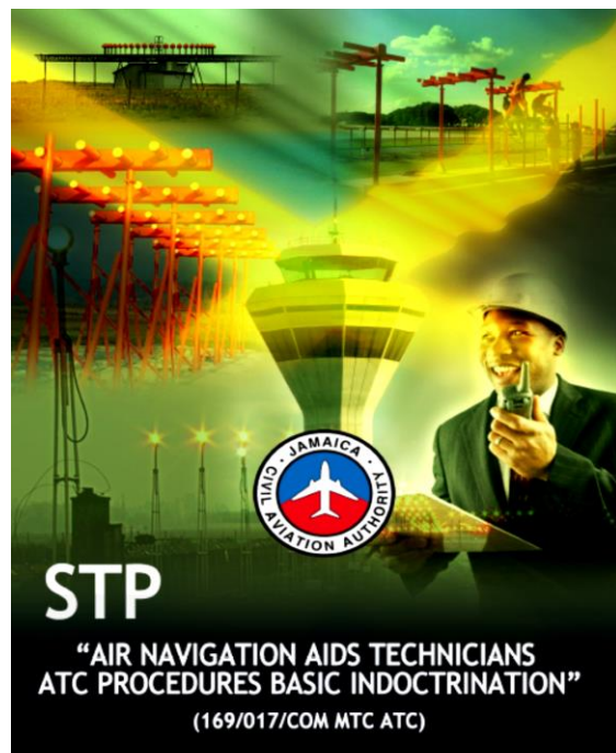
Cover page of Jamaica's Civil Aviation Authority Training Institute (CAATI) first TRAINAIR PLUS STP, entitled "Air Navigation Aids Technicians ATC Procedures Basic Indoctrination".