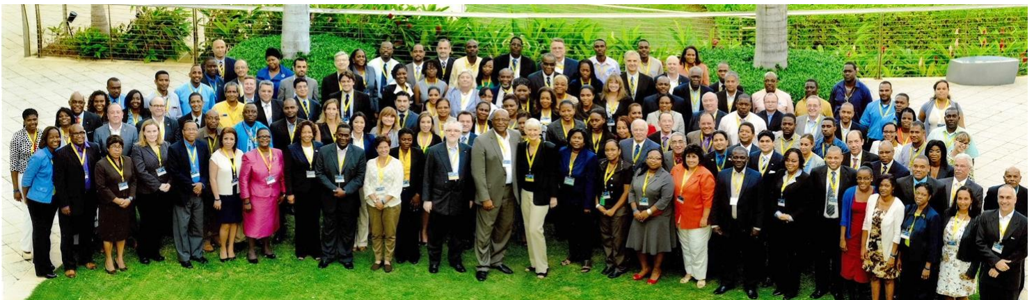
Group photo taken during the 5th NGAP/TRAINAIR PLUS Regional Symposium (Montego Bay, 5 to 7 February 2013)

The TRAINAIR PLUS team would like to thank those of you who attended the 5th NGAP and TRAINAIR PLUS Regional Symposium, which was held in Montego Bay, Jamaica from 5 to 7 February 2013. A total of 306 people from more than 20 States came together to exchange views, best practices and experiences in aviation training, as well as to network and enhance collaboration opportunities. We thank the Jamaica Civil Aviation Authority (JCAA) and the Civil Aviation Authority Training Institute (CAATI), who jointly hosted the event.