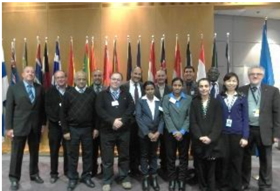
ICAO HQ, Montreal, Canada. Participants of the Training Developers Course held at ICAO Headquarters from 11 to 22 March 2013.

Do you want to train your course developers? The TDCs are the only way to train your course developers to design and develop STPs based on the TRAINAIR PLUS competency-based training methodology. Since 1 January 2013, 7 TDCs have been delivered; several others have been confirmed for delivery before the end of the first half of 2013. We encourage you to register your course developer as soon as possible. For an up-to-date schedule of TDCs and registration, please click here .