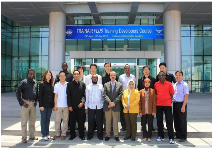
(Picture: Incheon. South Korea. Training Developers Course held at Incheon Airport Aviation Academy, from 25 June to 6 July 2012).

A number of TDCs will be held soon. This is the ideal way to train your course developers to design and develop STPs based on TRAINAIR PLUS competency-based training standards. For more information and registration, please click here .