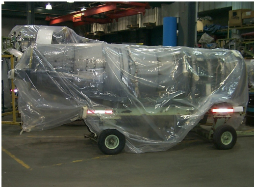
Figure 3 - Aircraft engine on cradle, ready to be shipped