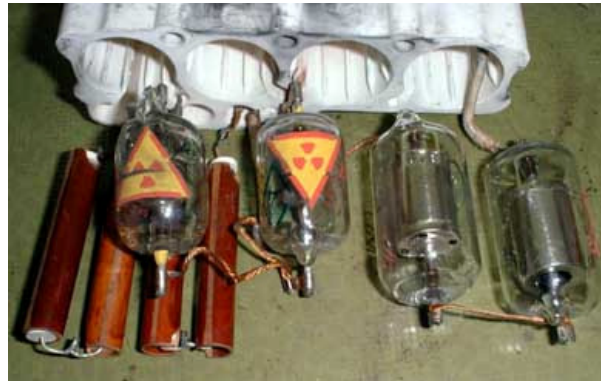
Figure 4 - Older version of spark gaps