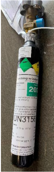
Picture 4 Currently used gas container.

Although the gas content do last for most transports it is a possibility that the operator may bring a spare bottle onboard the flight depending on the predicted total duration of the transport.