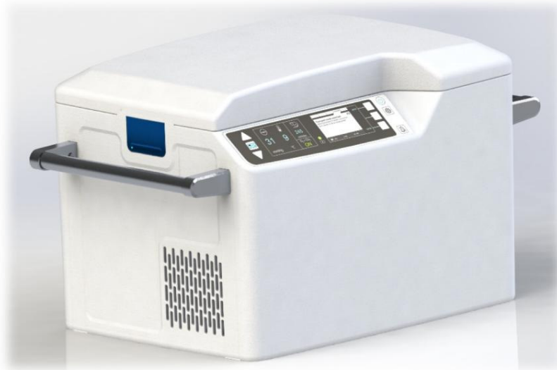
Picture 1 XVIVO Heart Box System

In an aircraft the system will be transported as in Picture 1 in the aircraft cabin secured according to the operating company's directions. I.e. The Box is closed and the device is running during the flight. Overall dimensions are 740 x 420 x 420 mm.