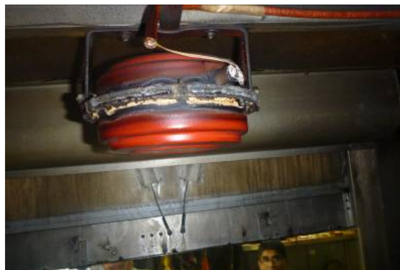
After fire test