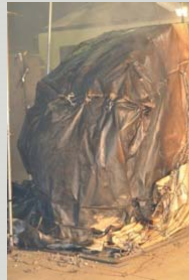
FCC fire test