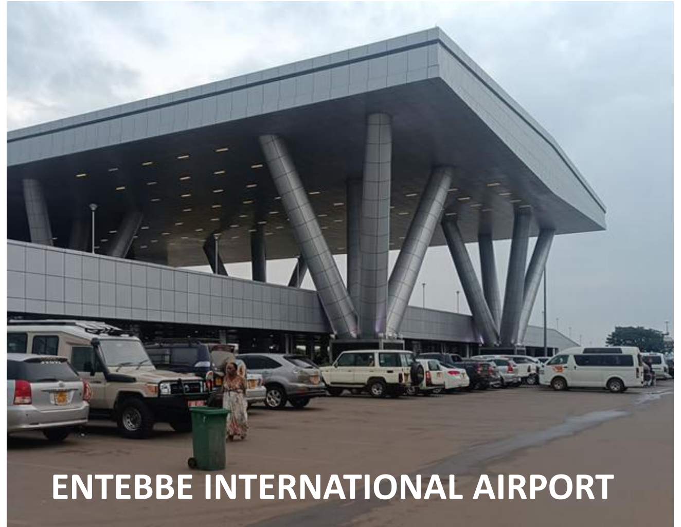
ENTEBBE INTERNATIONAL AIRPORT

Aviation Physician/Port Health Focal Person