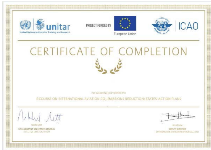
FIGURE 2: Certificate of Completion: International Aviation CO 2 Emissions Reduction: States' Action Plans

The second Phase of the ICAO Assistance Project with the EU Funding will conclude in October 2023. In light of the success of both phases of the Project, several States have expressed their interests in benefiting from similar capacity building assistance to mitigate CO 2 emissions from international aviation.