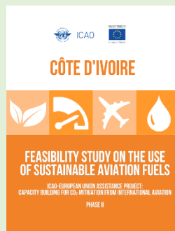
Feasibility Study on the use of Sustainable Aviation Fuels Cote d'Ivoire

The first three feasibility studies developed under the programme were funded by the EU and delivered during the CAAF/3 Conference in November 2023.