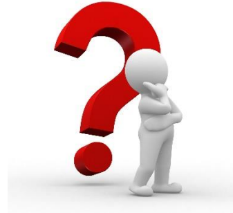
Questions and Feedback