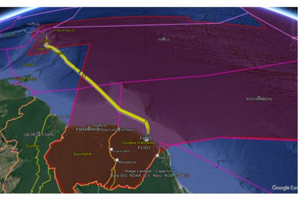
FMCC Area Cospas Sarsat