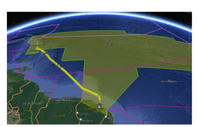
SRR MRCC Fort de France