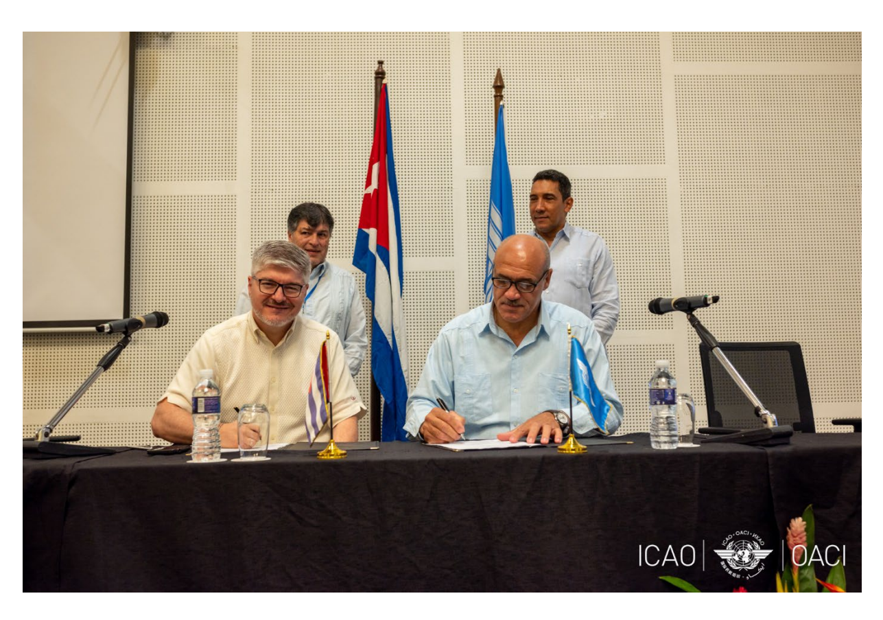
Air Navigation Planning in the NACC States