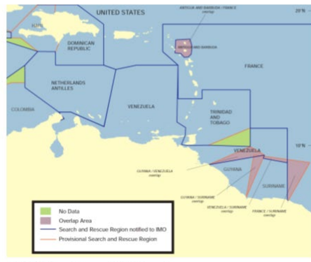
IMO Maritime SAR Regions