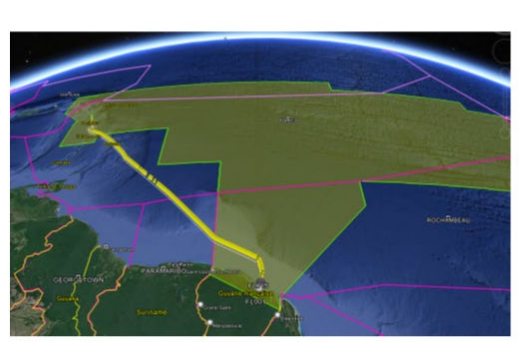
SRR MRCC Fort de France