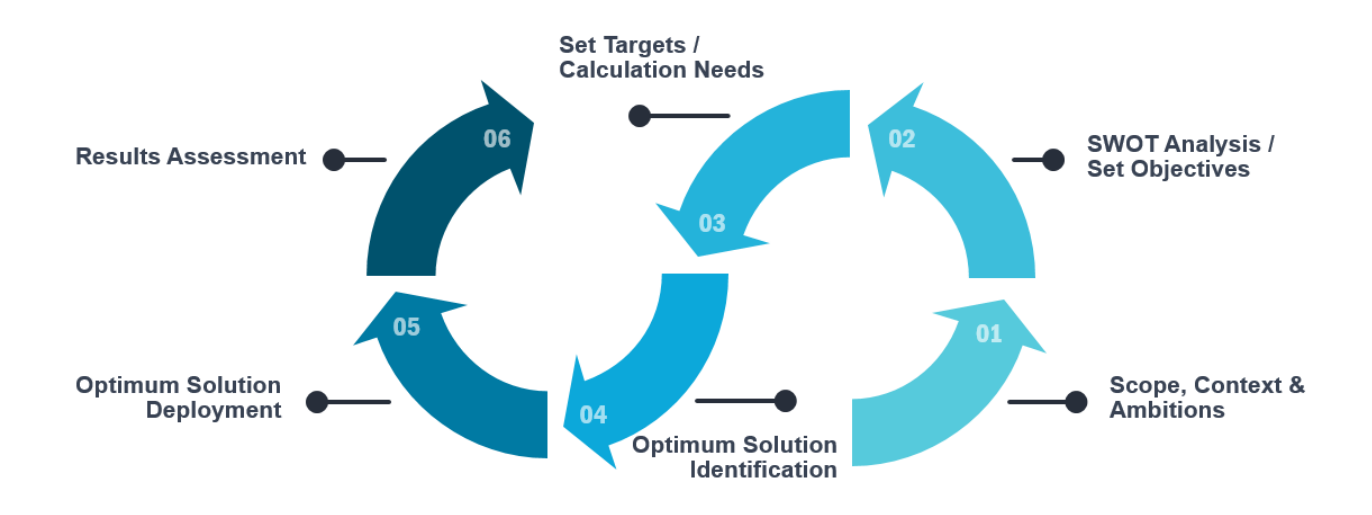
Figure 1 Six-step performance management process