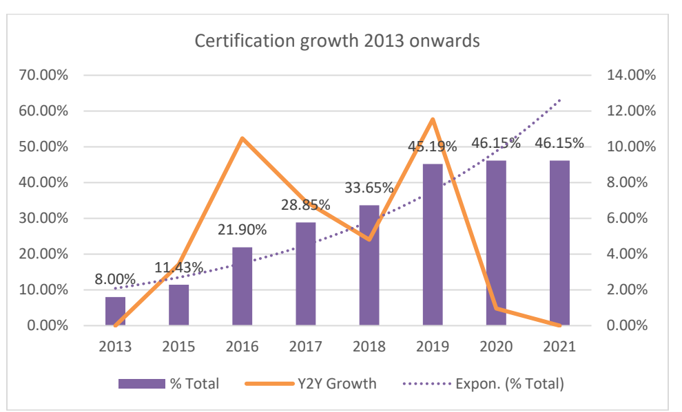
Figure 3.1: Certification of aerodromes in the SAM Region

3.2 With the COVID-19 pandemic, in some States the Certification processes had to be postponed. According to a survey applied to the States, the majority postponed the certification processes to 2022, while one State proposed to certify 7 aerodromes by the end of 2021. Another State is in the process of finalizing the certification of its second aerodrome (to achieve 100%) ,so it is expected that by the end of 2021 the figures will increase considerably.