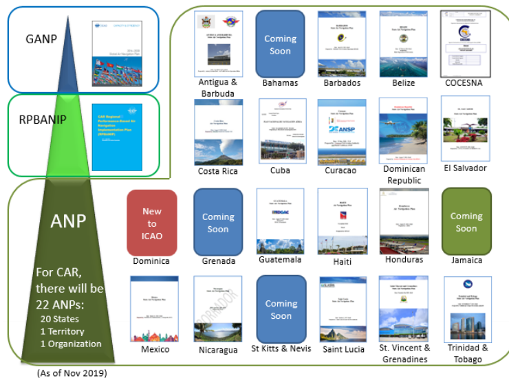
Figure 4.2: NANP Availability in CAR Region: https://www.icao.int/NACC/Pages/regional-group-ASBUb.aspx

4.2 The ICAO NACC RO determined that 22 States/Territories/Organizations in the CAR region need to have NANPs, while the NAM region needs two NANPs, Canada and United States. The status of the CAR region is shown in Figure 4.2.