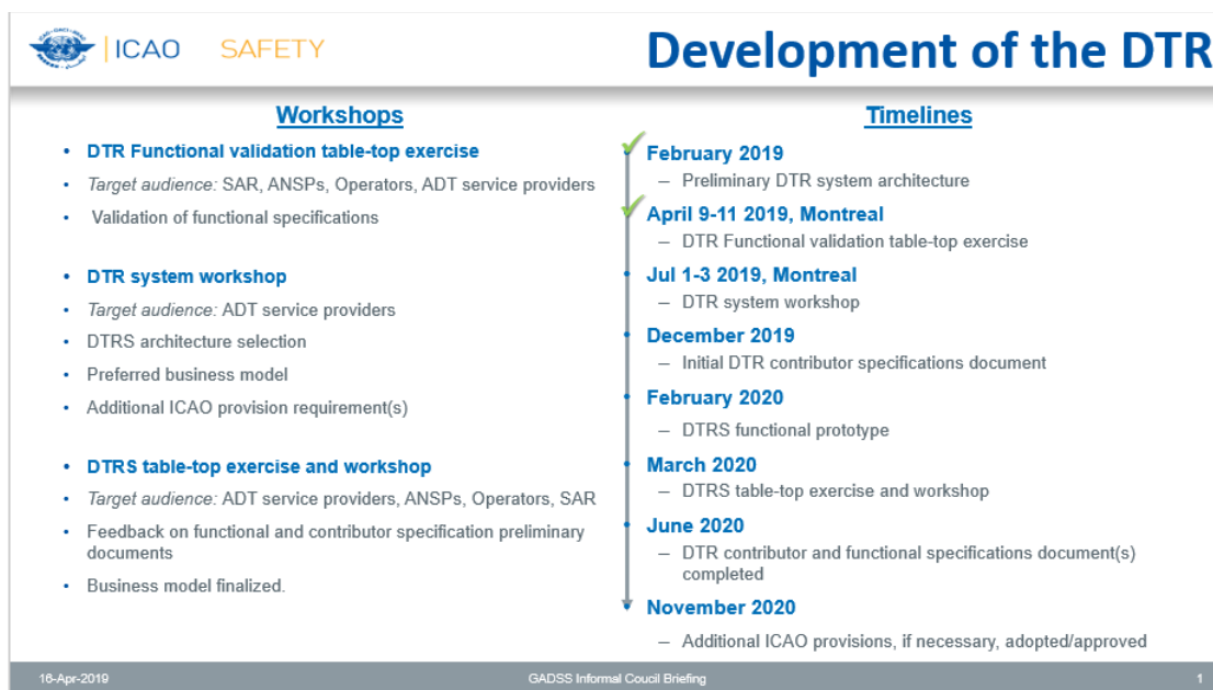
Figure 1: Presented by the ICAO Secretariat DTR Functional Workshop April 2019

1.1.3 Eurocontrol* has developed an architecture for the LADR (previously known as the Distress Tracking Repository). The document "EUROCONTROL - Distress Tracking Repository (DTR) Architectural Considerations" was sent by email to the GADSS Advisory Group on 23 May 2019 as part of an invitation to an ICAO-convened DTR Architecture Workshop, from 1 to 3 July 2019. ICAO plans to open a bidding process for the development and maintenance of the LADR operational infrastructure in Q3 of 2019 with a view towards providing an operational prototype of the LADR within one year. ICAO has announced an implementation timeline (Figure 1) which includes the planned availability of final LADR specifications in June 2020, the adoption of ICAO provisions for implementation and data contributions to the LADR shortly thereafter, in November 2020, in order to complete preparations to meet the January 2021 applicability date for the distress tracking component of the GADSS.