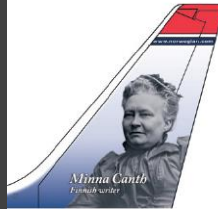
Minna Canth Finnish writer and activist