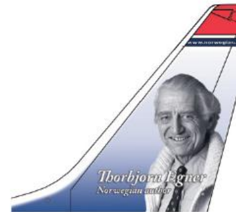
Thorbjørn Egner Norwegian writer