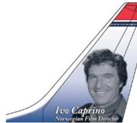
Ivo Caprino Norwegian film director