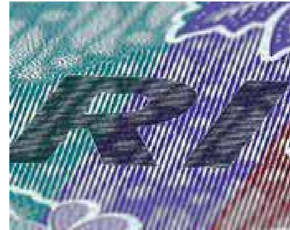
COUNT ON THE e-PASSPORT