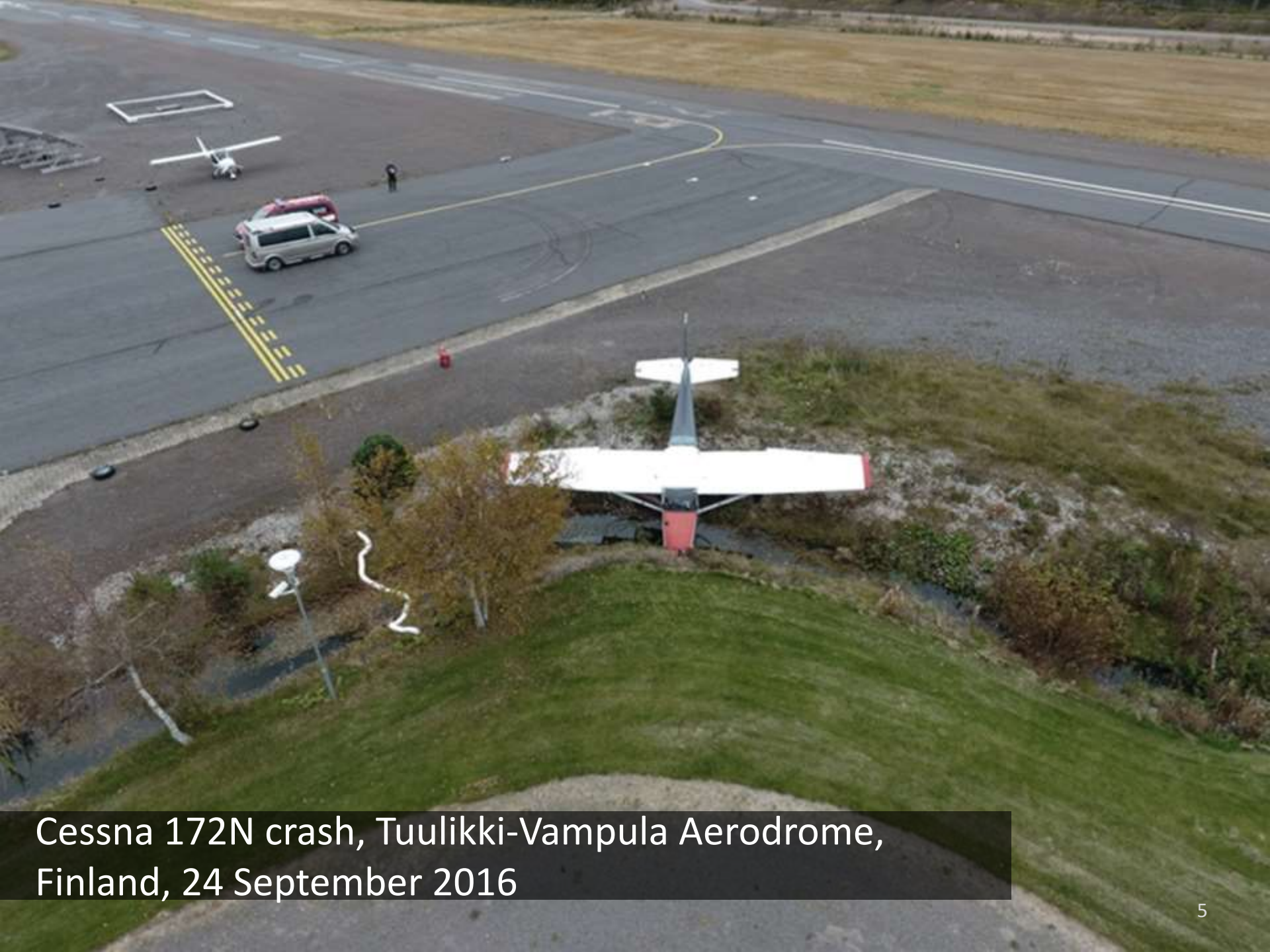
Cessna 172N crash, Tuulikki-Vampula Aerodrome, Finland, 24 September 2016