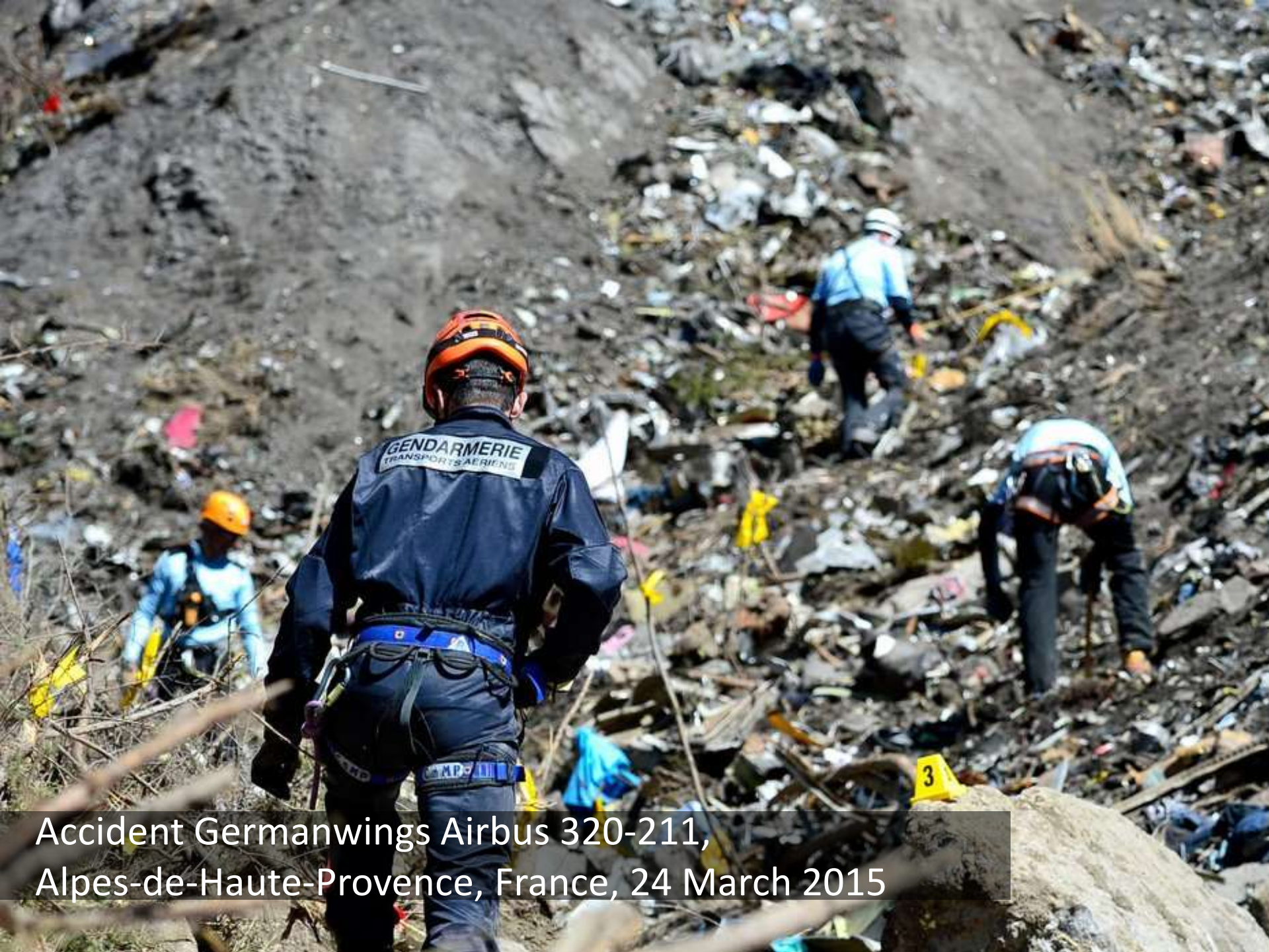
Accident Germanwings Airbus 320-211, Alpes-de-Haute-Provence, France, 24 March 2015