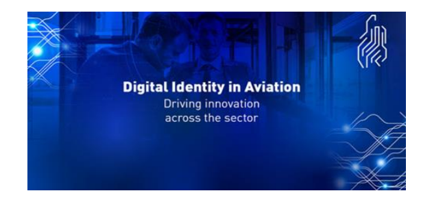
Digital Identity in Aviation: driving innovation across the sector