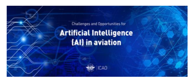
Challenges and opportunities of Artificial Intelligence (AI) in aviation