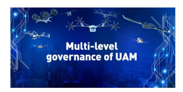
Multi-level governance of Urban Air Mobility (UAM)