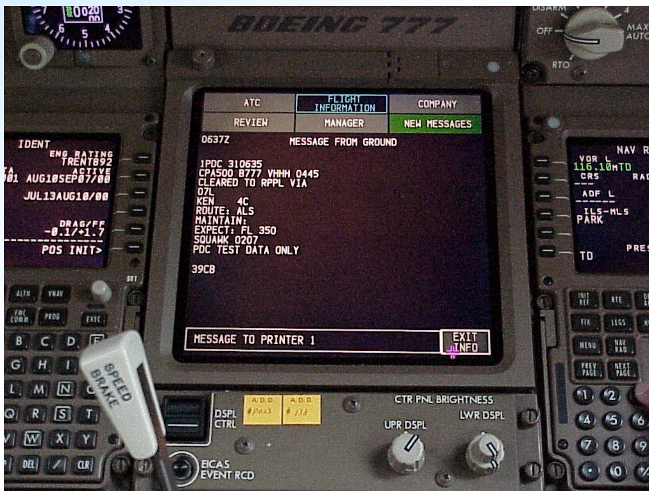
PDC Message Displayed in B777 Cockpit