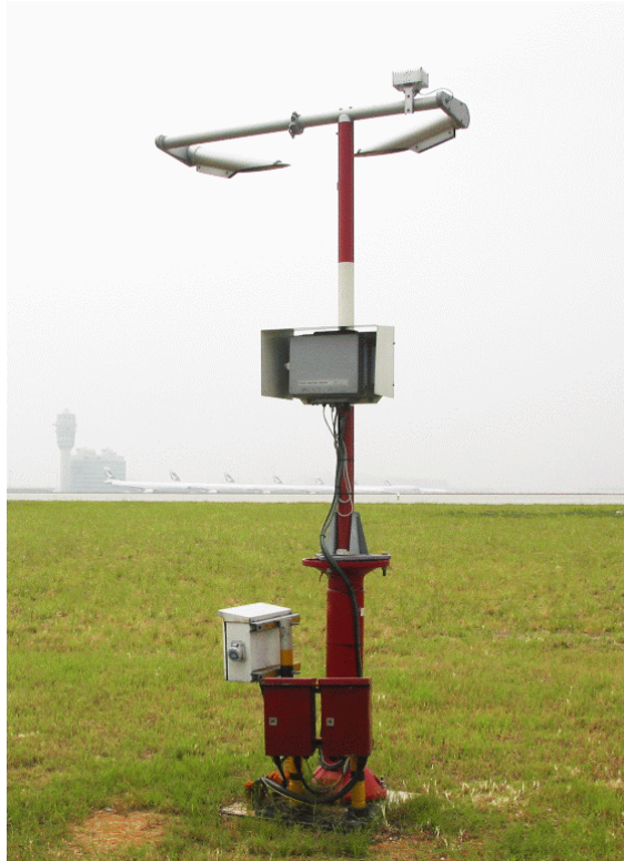
Figure 2 A forward scatter meter on HKIA