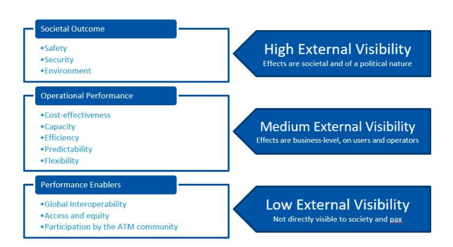
Figure 2 The 11 KPAs of the GANP