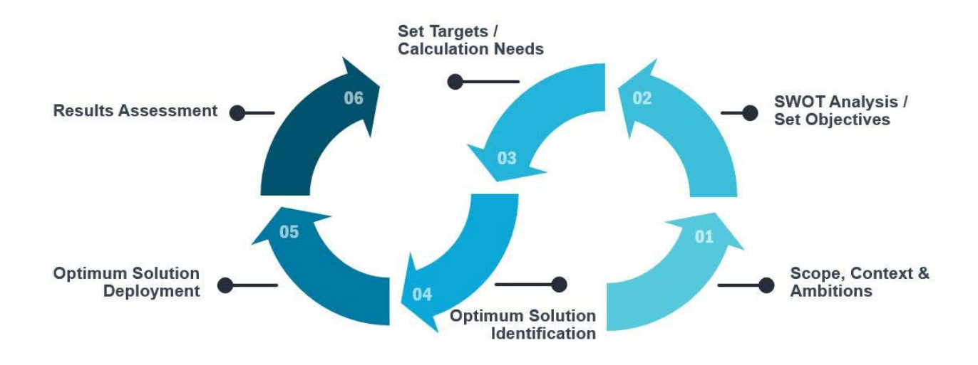
Figure 1 Six-step performance management process

1.6 Steps 1 and 2 serve to know the air navigation system, its strengths, weakness, opportunities and threats as well as how it is performing in order to set objectives. The catalogue of performance objectives that is part of the GANP global performance framework facilitates the definition of objectives.