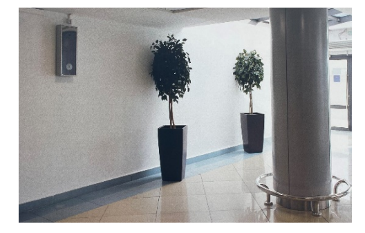
Recirculators for air disinfection