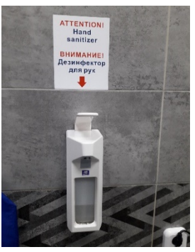
Dispensers with antiseptic hand sanitizer