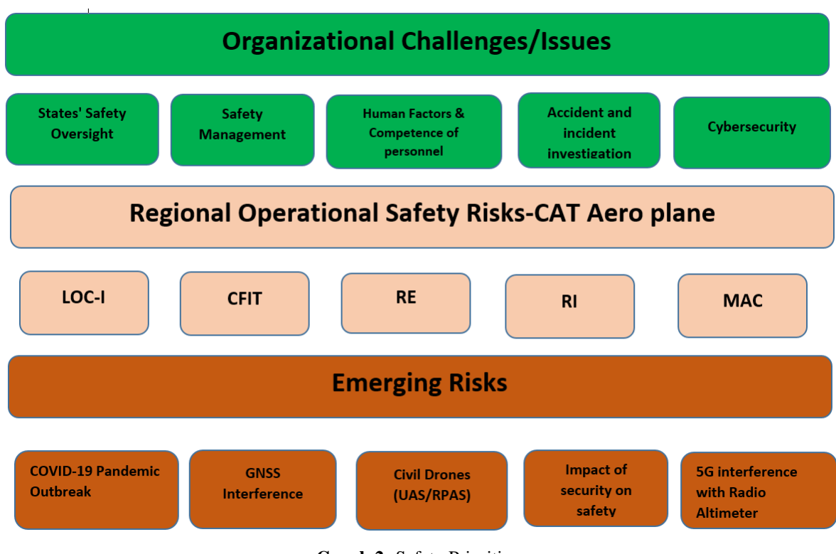
Graph 2: Safety Priorities

Therefore, the MID-RASP adopts three focus areas approach: