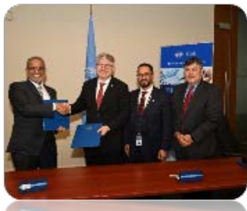
13 Agreements to support priority implementation needs of Member States