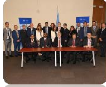
Leveraging from internal synergies to deliver Implementation Support through a "One-ICAO" approach.