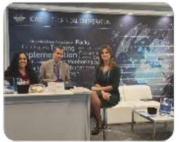
Enhanced visibility signaling a modernization and rebranding of Technical Cooperation activities

92 bilateral meetings providing a platform to interact with States on their implementation/training needs