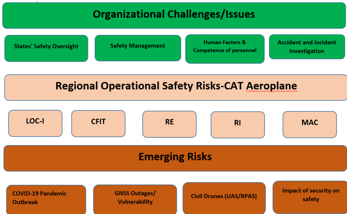
Graph 2: Safety priorities

Therefore, the MID-RASP adopts three focus areas approach: