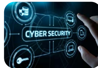
Cyber Security (AR,EN,Urdu,Malyalam)