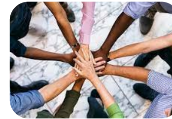
How To Build Aviation Security Culture(EN)