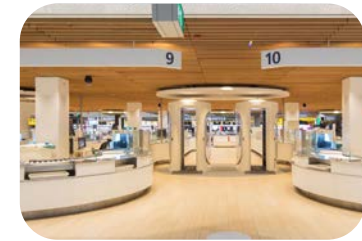
Representation of an exemplary Security checkpoint (EN)