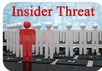
Insider threat (EN)