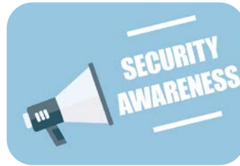
General Awareness Year of Security Culture (EN,AR,Urdu)