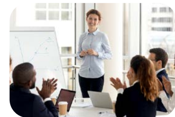
Importance of Training