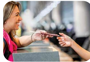
Passenger and Document assessment (EN)