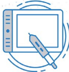
E - Test