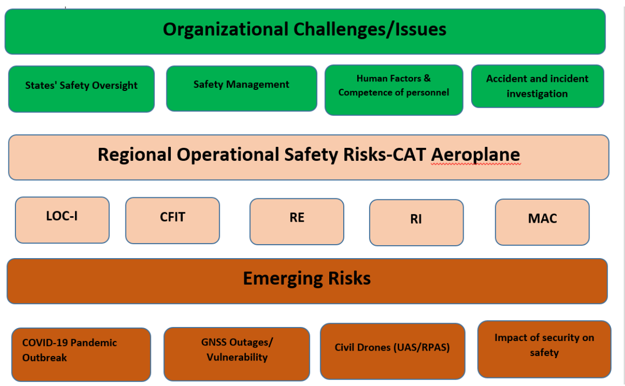
Graph 2: Safety priorities

Therefore, the MID-RASP adopts three focus areas approach: