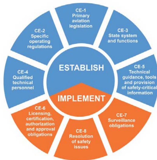
Figure 1. Critical elements of a State's safety oversight system

The eight critical elements (CEs) of a safety oversight system are defined by ICAO. [Region] is committed to the effective implementation of these eight CEs among all States in the region, as part of its overall safety oversight responsibilities, which emphasize [Region]'s commitment to safety in respect of its aviation activities. The eight CEs are presented in Figure 1.