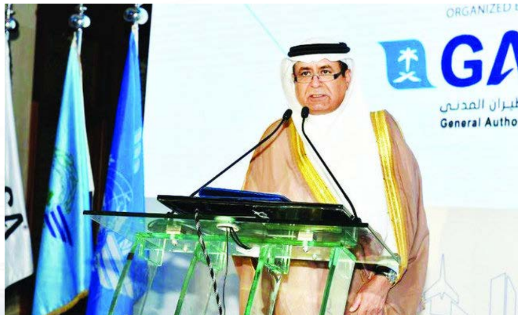
Minister of Transportation Sulaiman Al-Hamdan addressing, The Global Ministerial Aviation Summit, Riyadh, 31 Aug 2016, where the Riyadh Declaration was made