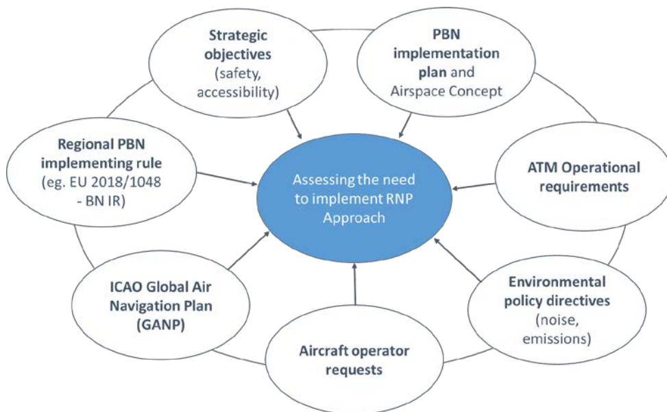
Figure 2: Assessing the need for RNP Approach implementation

5.2.2.7.2. Once the potential benefits are identified and agreed among all the stakeholders, there should be a high level consensus around the decision to implement RNP approach operations. At the same time, the actors need to comply with the applicable regulations in all areas of their activities. An additional reason to implement could be if it were required by a regional PBN regulation. This is the case in the European Union.