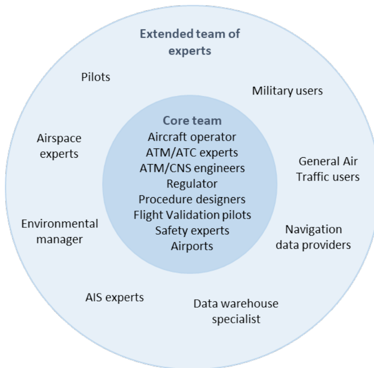
Figure 3: Establish a national RNP Approach implementation team