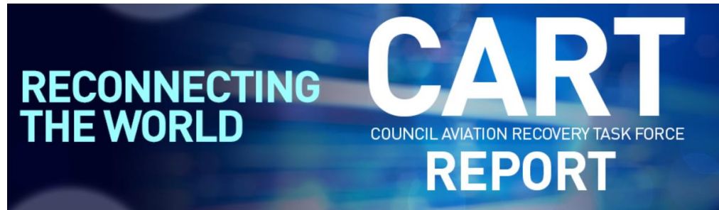
Joint Statement on COVID-19

Bilateral joint statement in early stages of COVID-19 pandemic