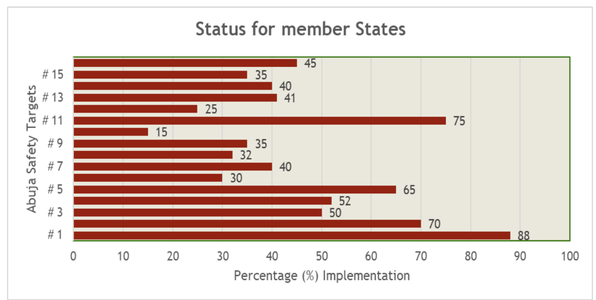
Figure 1: Status of Implementation of the AFI Safety and Air Navigation Targets by Member States