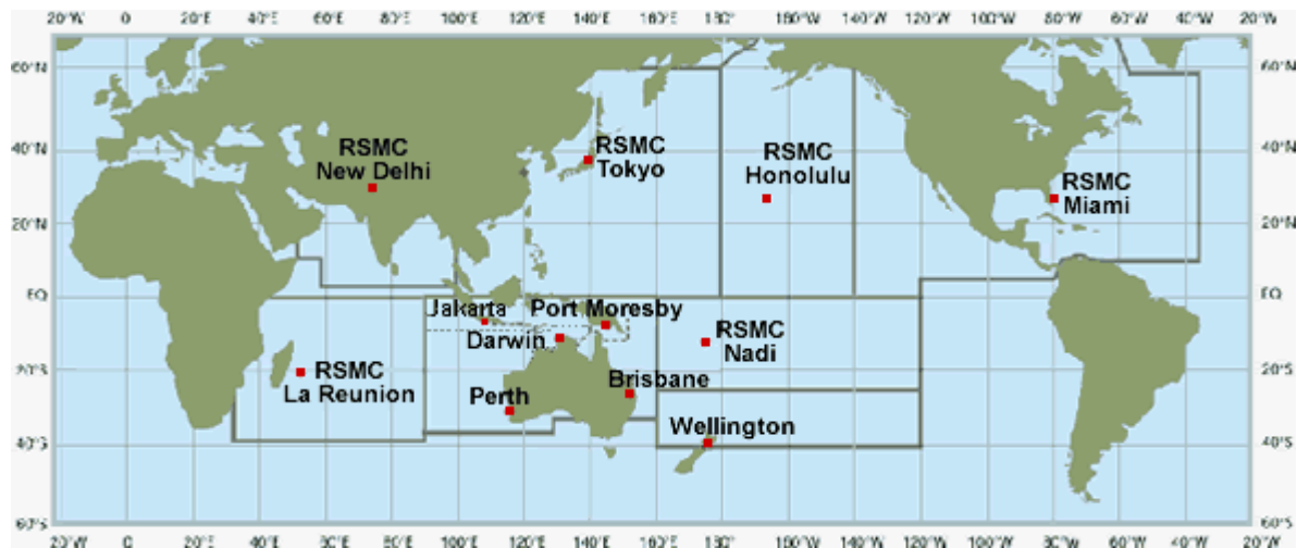
Figure 1 - Map of global Topical Cyclone Warning Centres (TCWC)

2.4 For TCWCs, WMO has established which centres act as a backup to other TCWCs in contingency situations. These are documented in the relevant WMO technical documents.