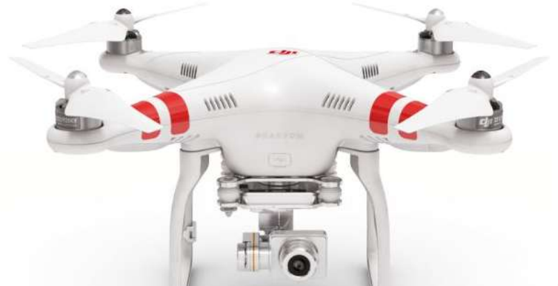
DJI Phantom 2