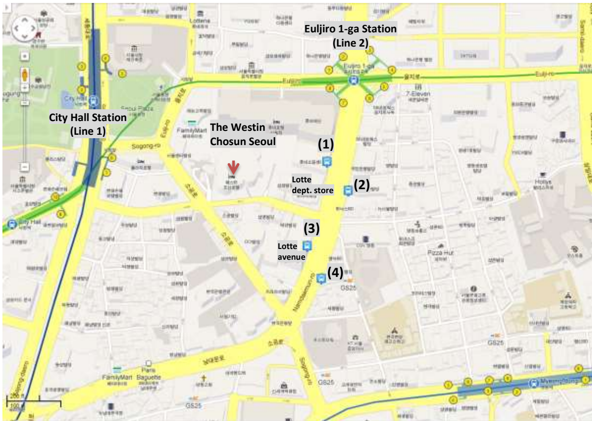
Figure 1 Map for the bus stops