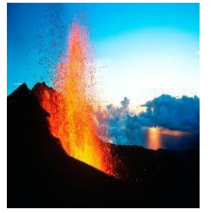
Piton de la Fournaise (La Réunion)