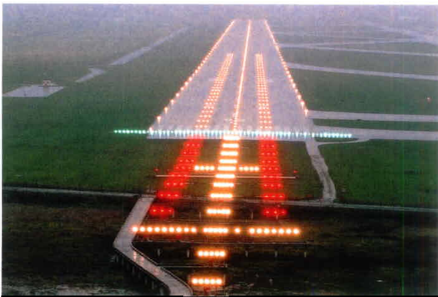
Information on the location of runway thresholds is needed for database entry well in advance of the commissioning date of a new runway

With respect to false warnings, industry sources indicate that over 62 percent of unjustified warnings arise from database errors, while more than 16 percent arise from flight management system (FMS) errors and over 13 percent stem