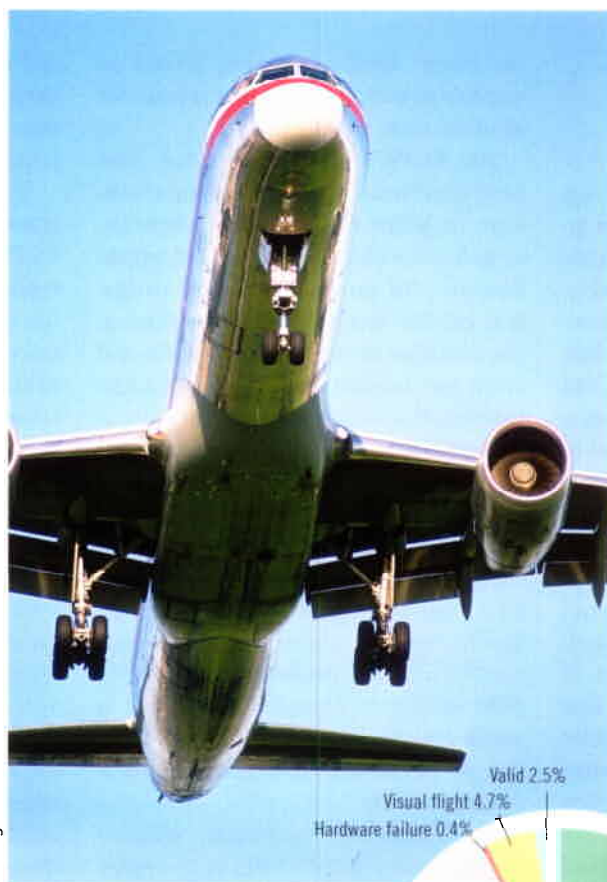
The problem of false EGPWS/TAWS warnings can be curtailed by adopting certain practices such as updating software and databases to the latest available standard. Most false warnings are related to database errors, as reflected in the pie chart supplied by Honeywell.

clearly call for attention by national regulatory authorities, aircraft operators and airframe manufacturers. To reduce the risk of CFIT as much as possible, countries around the world need to ensure that timely information of required quality on runway thresholds, as well as terrain and obstacle data, are provided for databases in accordance with the common reference systems (ICAO Annex 15, Chapter 3). ICAO requirements for runway, terrain