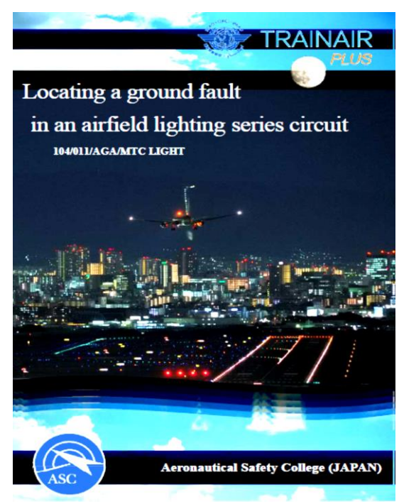
Cover page of Japan's Aeronautical Safety College (ASC) first TRAINAIR PLUS STP, entitled "Locating a Ground Fault in an Airfield Lighting Series Circuit".

For a list of all STPs, please click here.