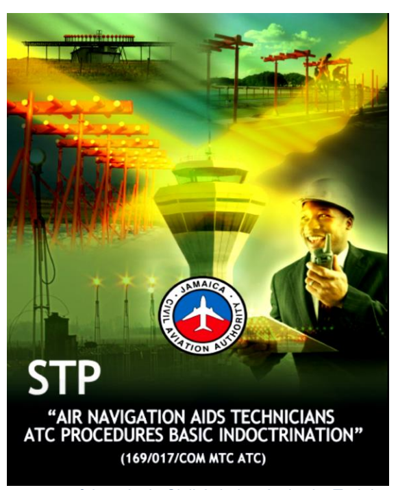
Cover page of Jamaica's Civil Aviation Authority Training Institute (CAATI) first TRAINAIR PLUS STP, entitled "Air Navigation Aids Technicians ATC Procedures Basic Indoctrination".