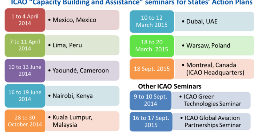
ICAO "Capacity Building and Assistance" seminars for States' Action Plans

In addition, ICAO updated its Doc 9988, Guidance on the Development of States' Action Plans on CO2 Emissions Reduction Activities, including the incorporation of "Rules of Thumbs" which simplify the methodologies for the calculation of emission reduction benefits for inclusion in the action plans. The emissions quantification elements of Doc 9988 have been automated in a software tool, known as the ICAO Environmental Benefits Tool (EBT).