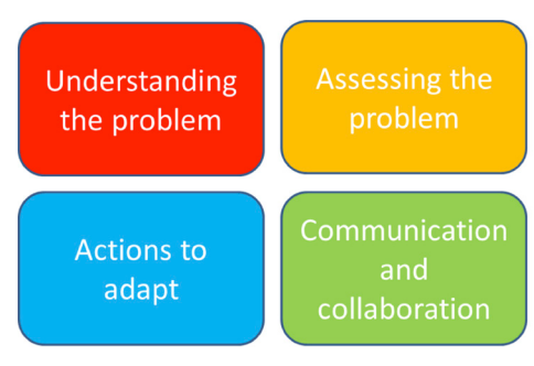
Figure 3. Key priorities for building aviation climate resilience

In September 2015 EUROCONTROL and Manchester Metropolitan University organized a workshop on Adapting Aviation to a Changing Climate. The 30 participants, representing industry, regulators and academia, identified four key priorities for action to develop climate change resilience for the European, and global, aviation sector ( Figure 3 ).